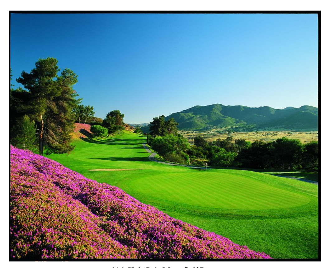
11th Hole Pala Mesa Golf Resort

Proceeds benefit our partnership with St. Catherine's Food Pantry Pala Mesa Golf Resort, Fallbrook CA Friday, September 18, 2015 11:30 a.m. Check-in 1:00 p.m. Shotgun Start